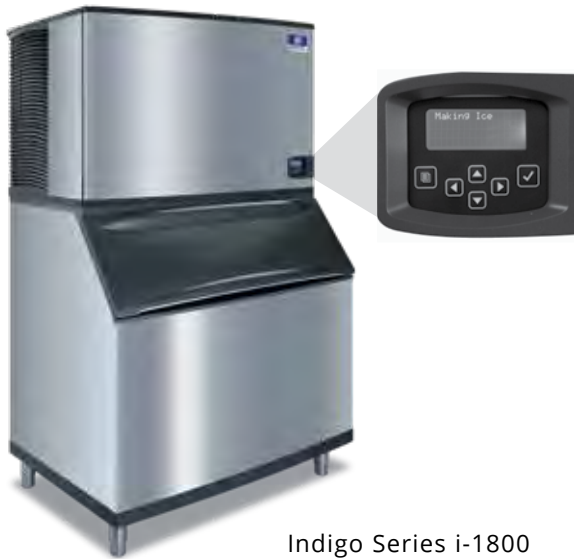
Indigo Series i-1800 Ice Machine on B-970 Bin

Designed for operators who know that ice is critical to their business, the Indigo® Series ice machine's preventative diagnostics continually monitor itself for reliable ice production. Improvements in cleanability and programmability make your ice machine easy to own and less expensive to operate.