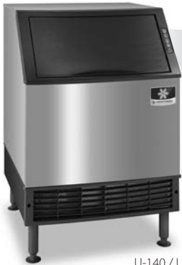
U-140 / U-190